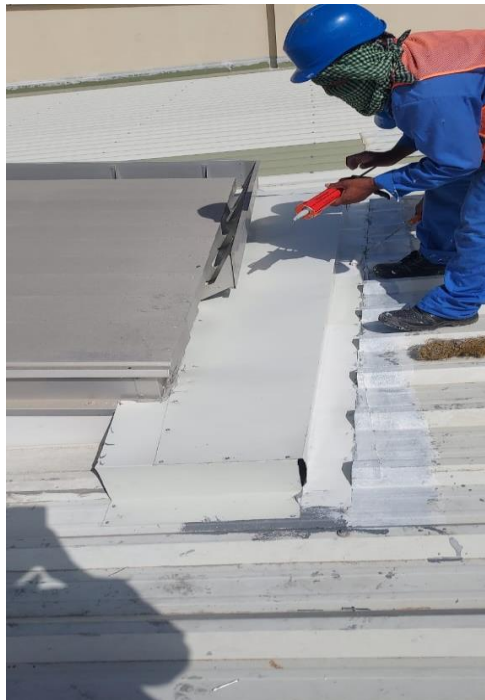
Fix 'L' Flashing in the front and close the top with a plain sheet to complete a box with 'L' diversion facing the slope. Apply Butyl Sealant to the joints.