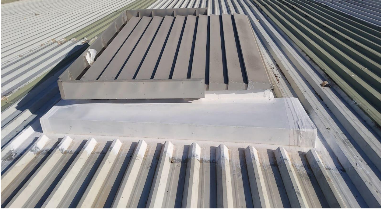
Apply 1 coat of Thermilate e-coat on complete box

THERMILATE MIDDLE EAST TRADING L.L.C P.O. BOX 234195, AL QUSAIS, DUBAI, U.A.E Email: thermilate@eim.ae Tel: +9714-2511390 • Fax: +9714-2511349 Web: www.thermilate.ae