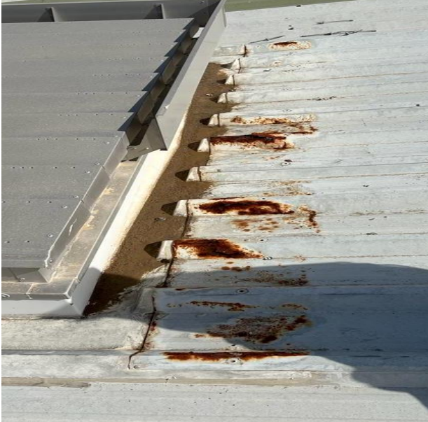
Ventilator joints rusted and leaking