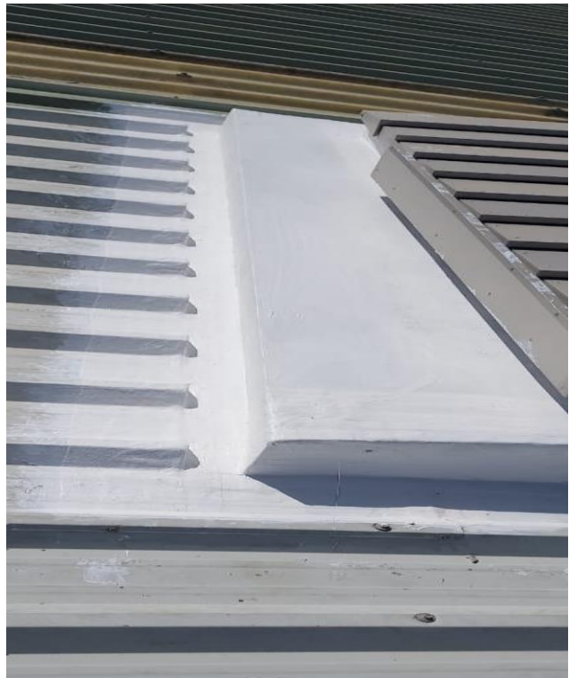
Apply second coat of Thermilate e-coat on complete box