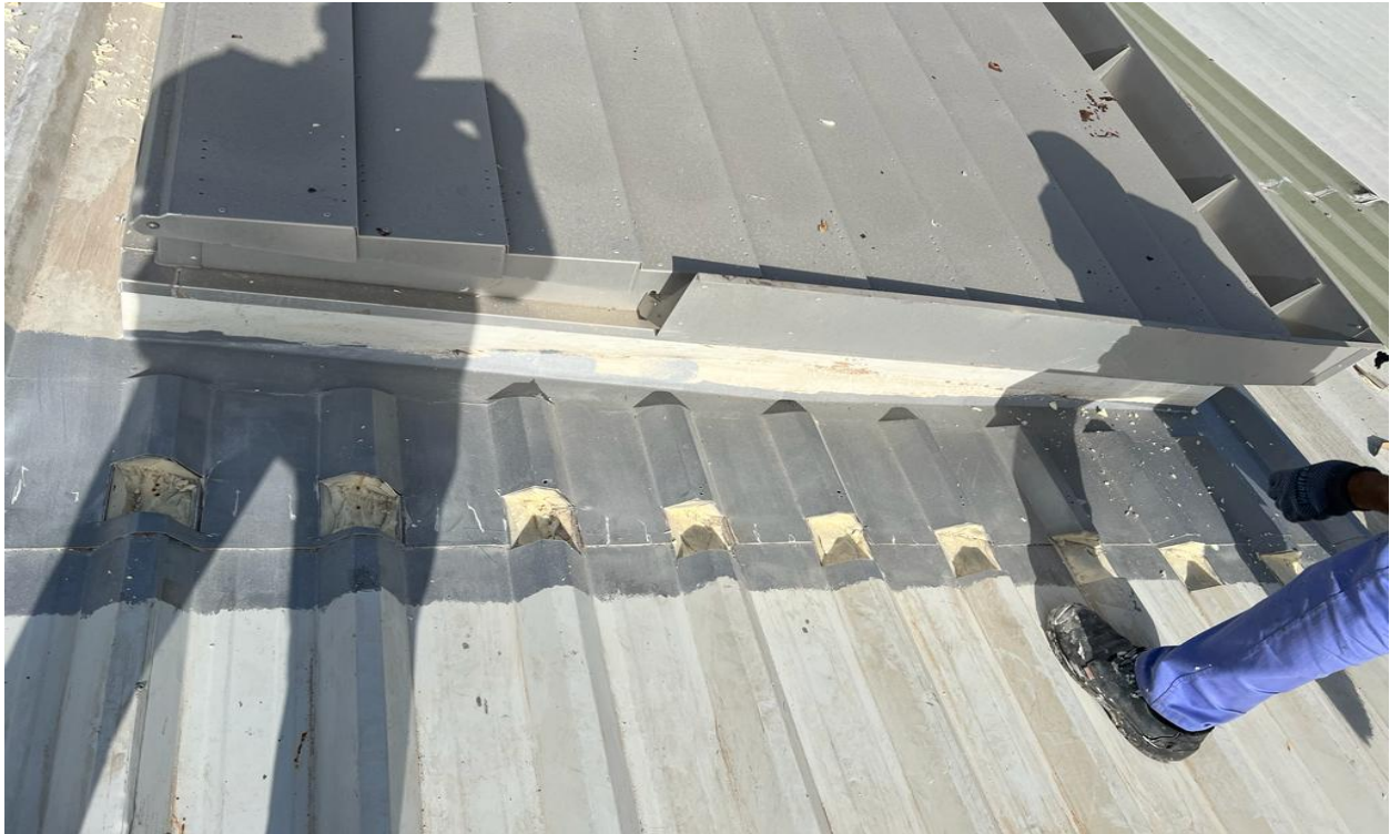
Cut corrugation in order to create slope

THERMILATE MIDDLE EAST TRADING L.L.C P.O. BOX 234195, AL QUSAIS, DUBAI, U.A.E Email: thermilate@eim.ae Tel: +9714-2511390 • Fax: +9714-2511349 Web: www.thermilate.ae